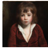
2 Sir Joshua Reynolds