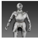
1 Field Armor