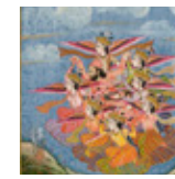
6 Gulshan-i 'Ishq (Rose Garden of Love)