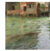
5 Frits Thaulow