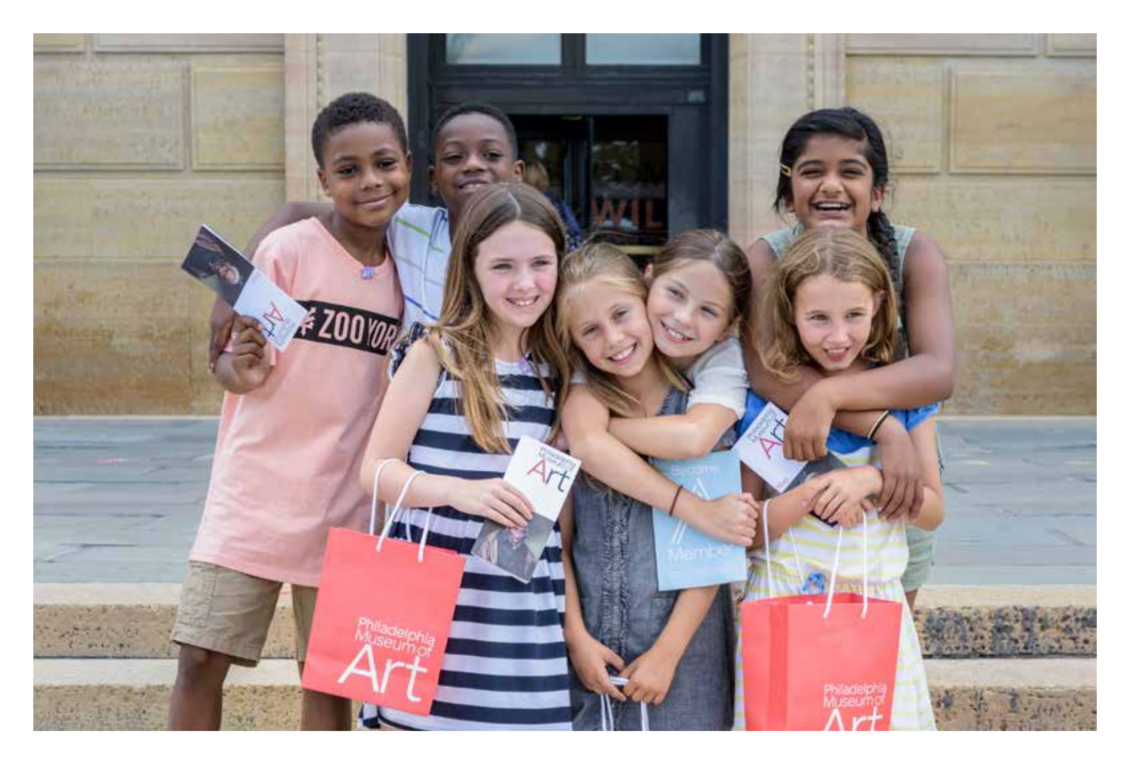
See you soon!